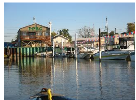
or by water.