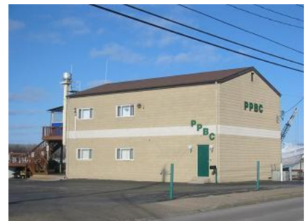
Visit us by land